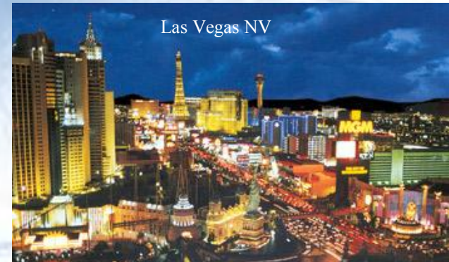
Las Vegas NV

PRODUCTIVITY & QUALITY: Higher productivity means higher profits. Better quality means a reputable name for your company. Local 797 members are the best trained and most productive plasterers and cement masons in the world. Getting the job done right the first time is the key to your job being on-time and on-budget.